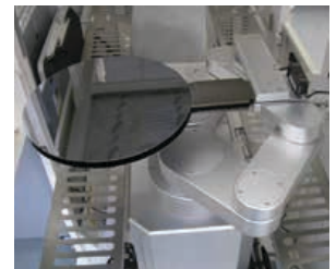
WAFER DUAL ARM ROBOT HANDLING